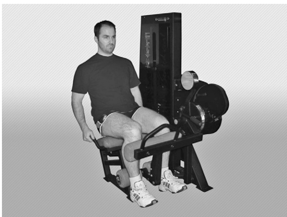
Figure 2 Concentric end range on leg curl machine.

Rated soreness and tenderness were evaluated at baseline and 24, 48 and 72 h post-exercise using a visual analogue scale (VAS). The VAS consists of a 10 cm horizontal line with the two end points labeled 0 (no pain) to 10 (worst soreness ever) (Huskinson, 1974; Joyce et al., 1975). Participants were asked to make a vertical slash across the 10 cm line that corresponded to the level of pain intensity between the limits of no pain felt (left end of line) and worst soreness ever (right end of line). A blank scale was used each time to avoid bias from previous measurements.