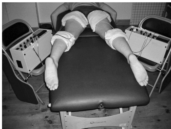
Figure 3 Subject position for FSM treatment.

muscles and positioned so that the patient could not see the front panel of the device or determine which machine was turned on (Figure 3). As DOMS was induced in only the hamstring muscle group, the current was directed only through the soft tissues in this muscle group. The positive leads from the device were attached to graphite gloves that were wrapped in wet towels and placed on the upper portion of the participants' thighs. The negative leads were attached to graphite gloves that were wrapped in wet towels and placed below the participants' knees. This allowed the current to flow between the two leads through the soft tissues of the treated leg. One of the machines was turned off providing the sham treatment and the volume on the working machine was turned down.