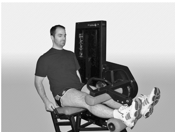
Figure 1 Eccentric end range on leg curl machine.